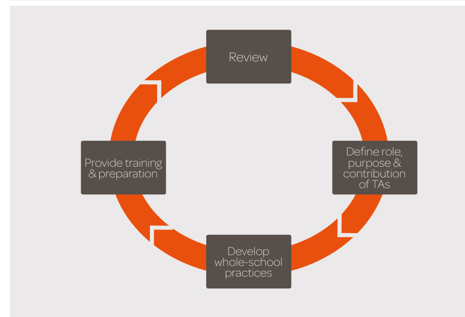
Figure 3. A process of school improvement regarding the use of teaching assistants

Figure 3 shows a model for school improvement that SLTs have previously found useful in reviewing the current use of TAs and guiding a process of change. This should shape an action plan for your school, which can then act as a foundation for training and deploying staff. Importantly, training should include supporting teachers in how to work effectively with TAs.